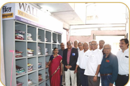
Wall of Kindness