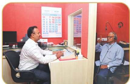
Rotary Institute of Speech & Hearing