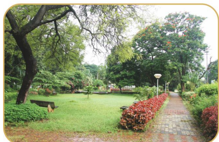
Rotary Nana Nani Park