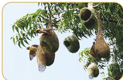
Rotary Pakshitirth (Bird Sanctuary)