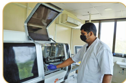
Rajarshi Shahu Blood Centre