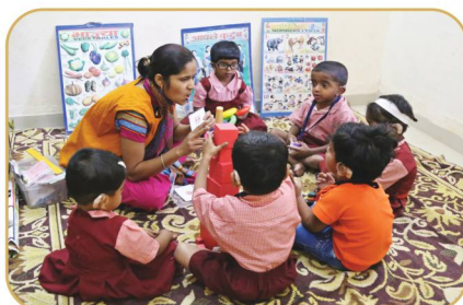
Late Kamalakar Nevgi Karnabadhir Shishu Vidyalay