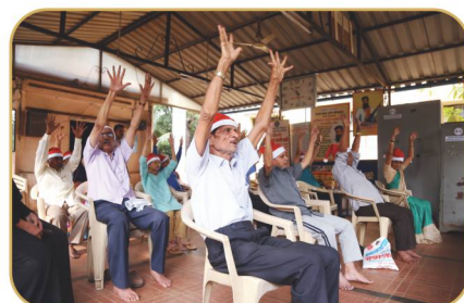
Parkinson Rehabilitation Centre