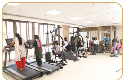
Rotary Physiotherapy Centre